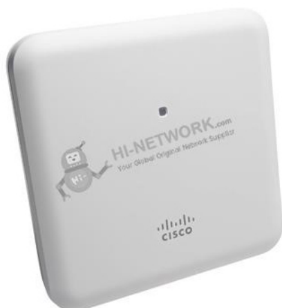
Figure 1 shows the appearance of the AIR-AP1852I-C-K9.