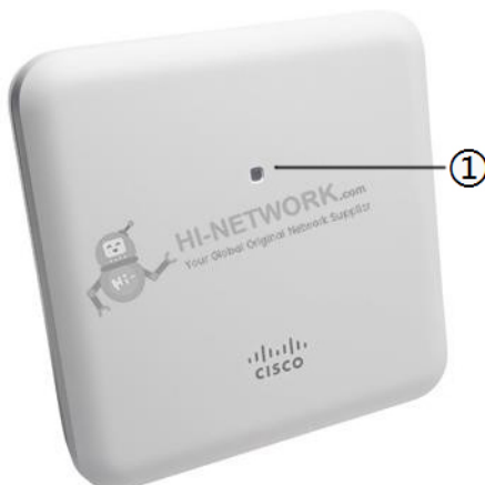
Figure 1 shows the AIR-AP1852I LED Indicator Position.