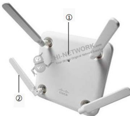
Figure 2 shows the AIR-AP1852E LED Indicator Position.