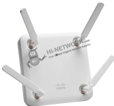
Figure 1 shows the appearance of the AIR-AP1852E-E-K9.