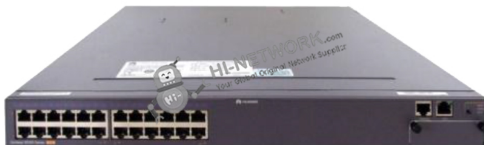
Figure 1 shows the appearance of LS-S5328C-PWR-EI.