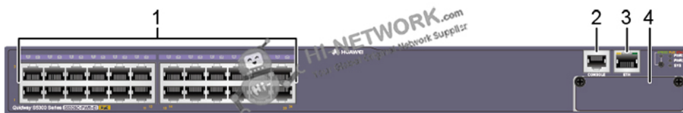
Figure 2 shows the front panel of LS-S5328C-PWR-EI.