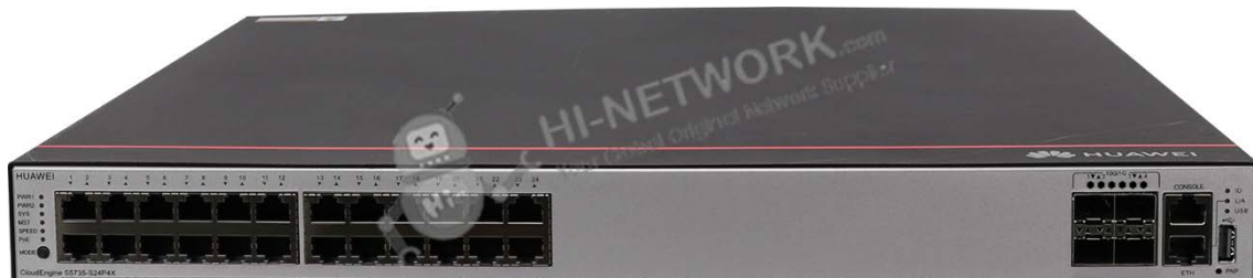
Figure 1 shows the appearance of S5735-S24P4X.