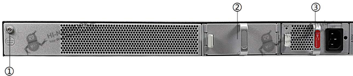
Figure 3 shows the back view of S5735-S24P4X.