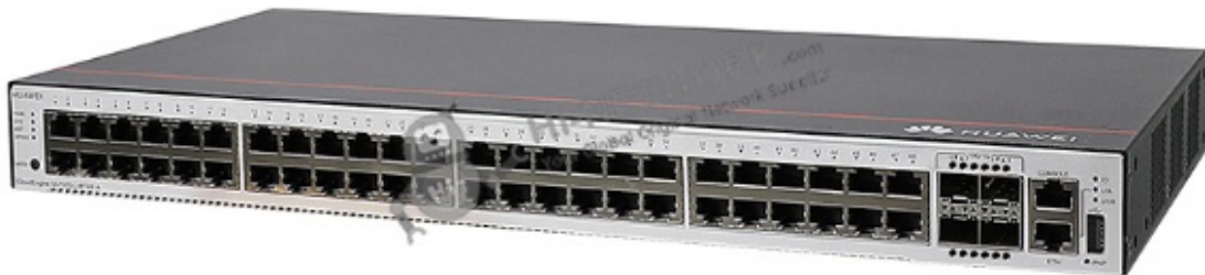
Figure 1 shows the appearance of S5735S-L48T4X-A.