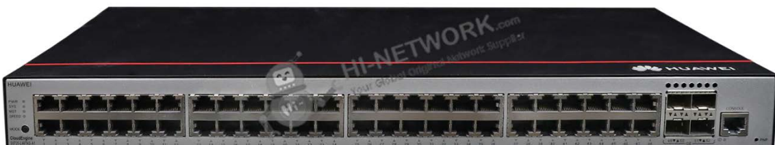
Figure 1 shows the appearance of S5735-L48T4S-A1.