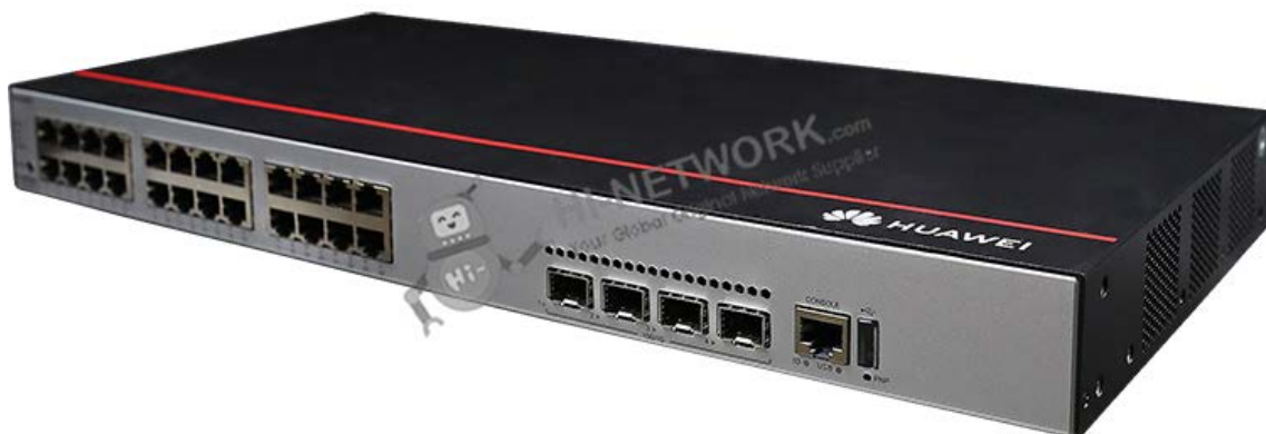
Figure 1 shows the appearance of S5735-L24T4X-A1.