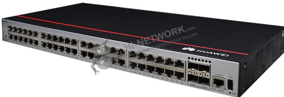
Figure 1 shows the appearance of S5735S-L48P4X-A1.