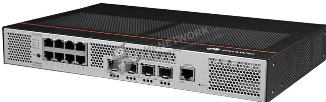
Figure 1 shows the appearance of S5735-L8T4S-QA1.