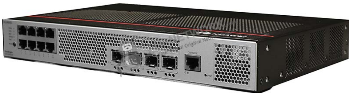
Figure 1 shows the appearance of S5735-L8P4S-QA1.