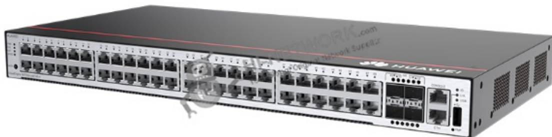
Figure 1 shows the appearance of S5735S-L48T4S-A.