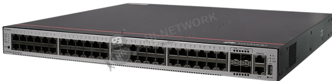
Figure 1 shows the appearance of S5735-S48T4X.