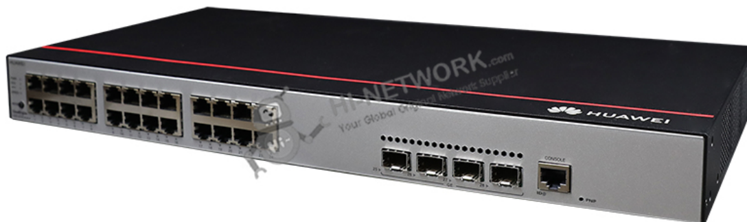
Figure 1 shows the appearance of S5735S-L24T4S-A1.