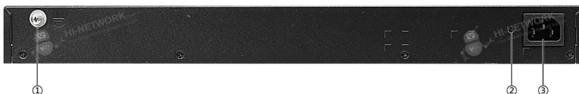
Figure 3 shows the back view of S5735S-L12P4S-A.