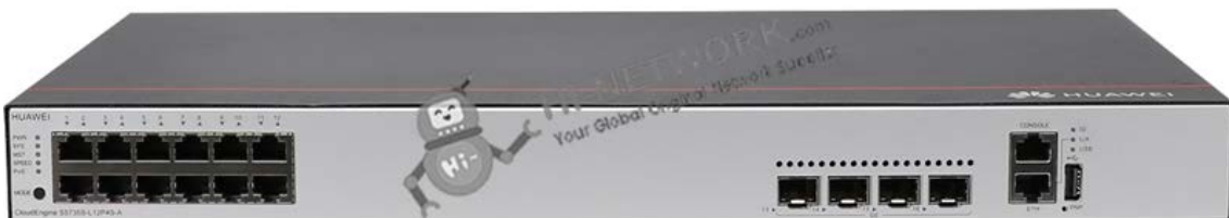
Figure 1 shows the appearance of S5735S-L12P4S-A.