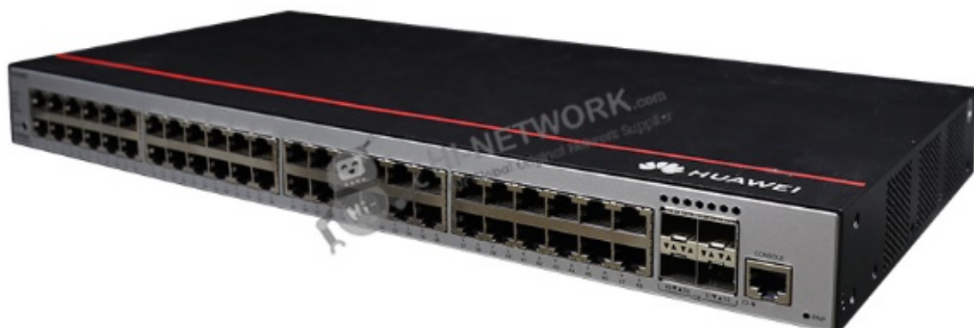
Figure 1 shows the appearance of S5735S-L48T4S-A1.