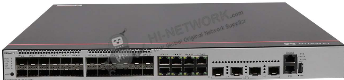
Figure 1 shows the appearance of S5735-S32ST4X.