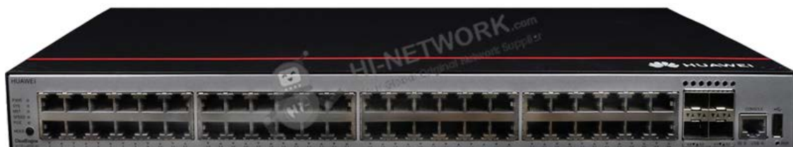
Figure 1 shows the appearance of S5735-L48P4S-A1.